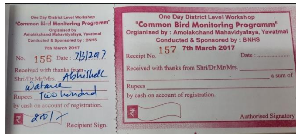
Workshop Receipt Book-101 to 156