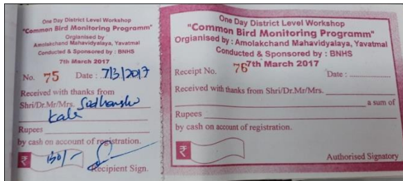
Workshop Receipt Book-1 to 75

Some selected photos from the one day district level workshop--.